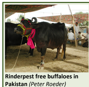
Rinderpest free buffaloes in Pakistan (Peter Roeder)

Key to this strategy was the use of community-based animal health workers to both detect disease outbreaks and vaccinate against the disease. These workers proved particularly effective in remote and insecure areas where lack of veterinary services for livestock keepers had long been a hindrance to eradication efforts. In southern Sudan, where armed conflict had disrupted cold chains and brought vaccination efforts to a standstill by 1992, animal health workers were able to vaccinate over 4 million cattle between 1993 and 1995. As a result of this vaccination and effective surveillance, confirmed outbreaks dropped from 11 in 1993 to one in 1997, the last case of rinderpest to be confirmed there.