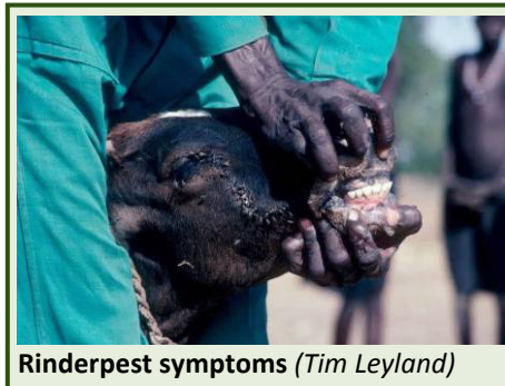
Rinderpest symptoms (Tim Leyland)

Rinderpest, or cattle plague as it is known in English, is renowned as the most dreaded of cattle diseases, on more than one occasion, changing the course of history. Present since cattle were first domesticated, rinderpest increasingly inflicted devastating losses on livestock populations as the human population grew and, with it, the importance of farmed livestock. Africa remained free of the disease until the 1890s. But in little more than two years, the disease killed more than 90 per cent of cattle, buffalo and related wild animal species from the Horn of Africa down to the Cape. The impact in Ethiopia alone was the loss of a third of its human population.