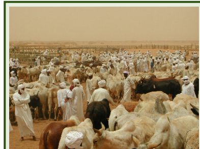
Rinderpest free cattle in Omdurman, Sudan

Concerted effort by national veterinary services in both industrialised and developing countries, aided by international organisations, has brought the once dreaded rinderpest livestock disease to the point of extinction. In its severest form, rinderpest is capable of killing up to 95 per cent of the animals it infects. However, the development of new vaccine technologies, community-based health delivery and disease searching techniques and diagnostic tools over the last 20 years has helped to protect the livelihoods of the livestock-dependent rural poor in developing countries and avoid massive financial losses in terms of milk, meat, and animal traction.