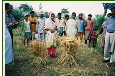
A female farmer of Jharkhand comparing her harvest of a local variety (left) and Ashoka 200F (right) (Dr. Katherine Steele)

In the five districts surveyed, the assessment estimated that around 200,000 farmers were growing an estimated 30,000 hectares of Ashoka varieties. If its adoption had been similarly high across the four states in which it was released - Jharkhand, Rajasthan, Gujarat and Madhya Pradesh - it is highly likely that some 400,000 hectares of Ashoka rice would be being grown by nearly 3 million households today.